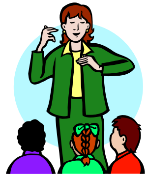
“...keep the words simple...”

Please - Make a circle with the right flat hand over the heart.