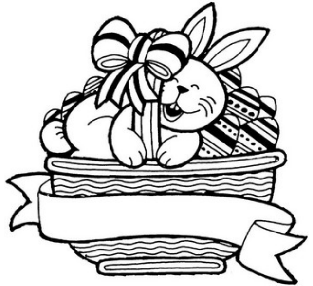
Color the picture.