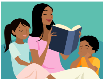
“read to your children often...”

“Read to your children often to instill a love of reading in them to last a lifetime. Let them pick the book you read and watch them sit and listen”