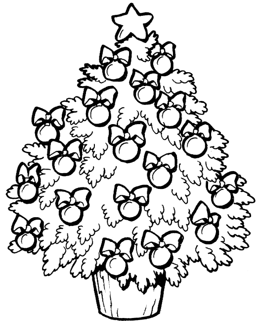
Color the picture.

How many words can you make from Happy Holidays?